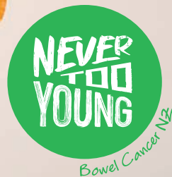
Chelsea Diagnosed at 39

“I THOUGHT ONLY OLDER PEOPLE GOT BOWEL CANCER AND THAT I WAS TOO YOUNG”